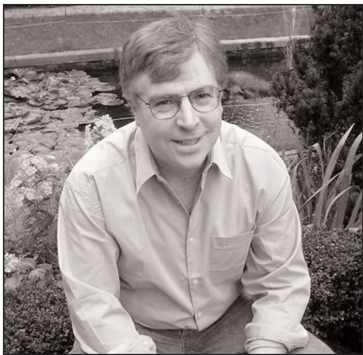
Paid for by Redpath for Chair © 2008